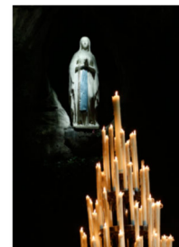
Image: Candles burn in front of the statue of Mary at the grotto at the Shrine of Our Lady of Lourdes in France.