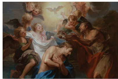
The Baptism of the Lord, Antoine Coypel, LACMA